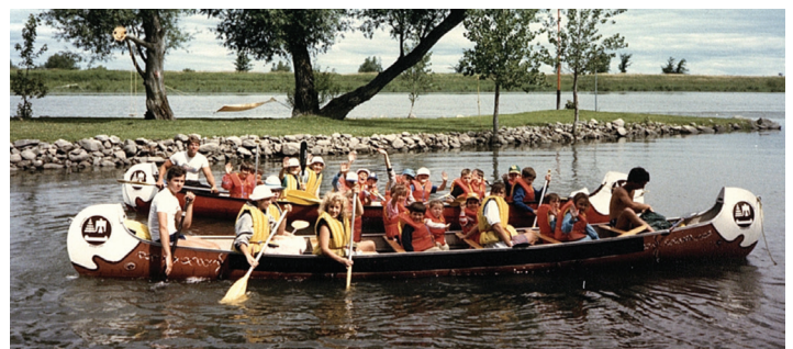
Paddlers on the Richelieu. Playground Photograph 1986 (SHGBMSH, P10/F1.1)

A typo slipped into the article “The First Otterburn Park Fire Department” (November 2023). The date of creation of the Fire Department was 1962 and not 1982.