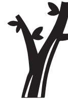
BRANCH COLLECTION CALENDAR 2025

For any questions or assistance, feel free to contact the Citizen Office at 450-536-0303.